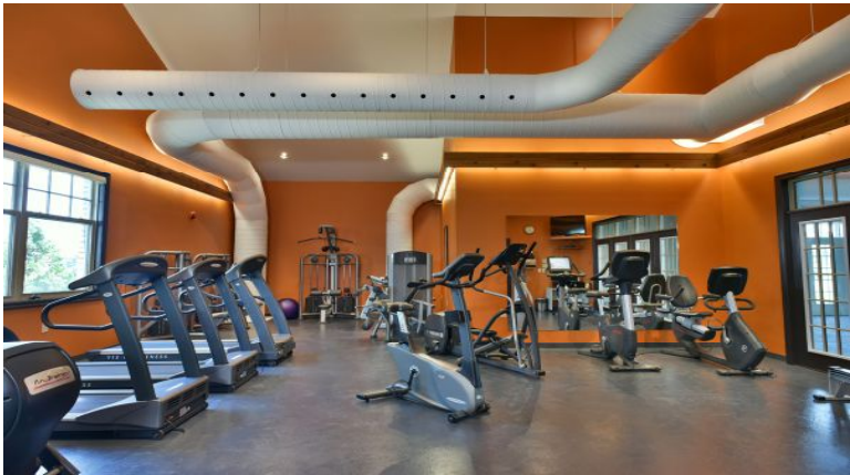
Use of the communiuity gym