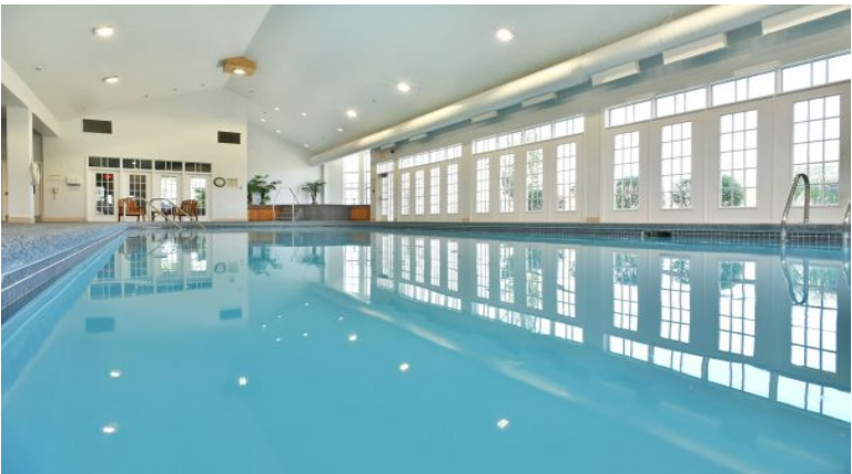
Take a dip in the pool or relax in the jacuzzi