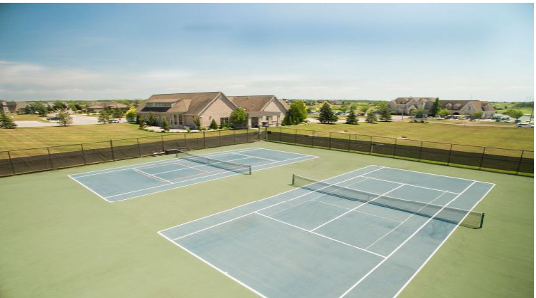
Challange your freinds over at the tennis courts