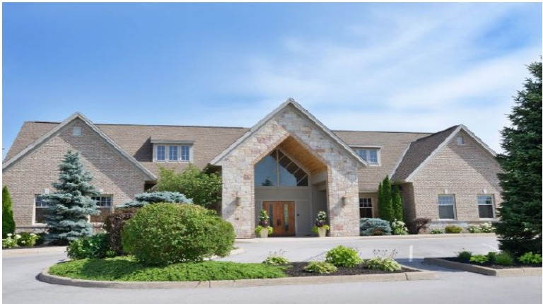
Acsess to the Hunter's Pointe Community Center